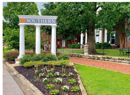
UT Southern, Pulaski, Giles County, TN